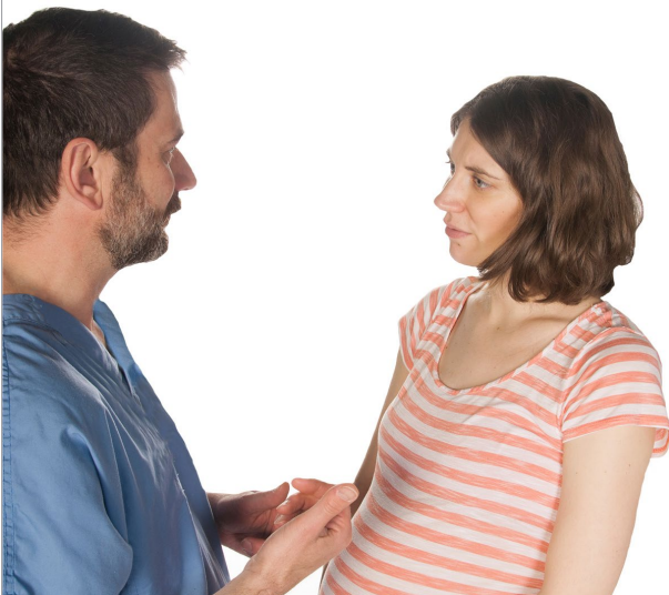
Oral hyperglycemia test

This test is usually is well tolerated. If you feel unwell, let us know. Some people have heartburn or vomiting. If you vomit the Glucodex drink, the test will be cancelled. The professional will give you back your prescription and tell you to come back another day.